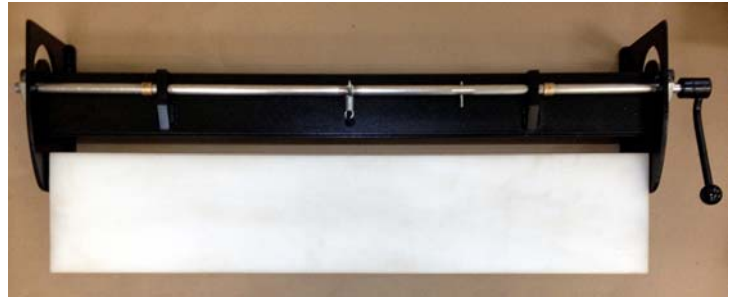
Edge Turner – 2